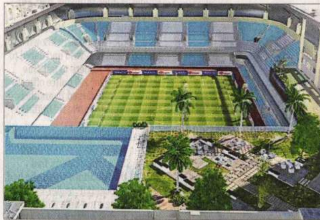
An Olympic-level sports complex, TransStadia, has been developed at Kankaria in Maninagar